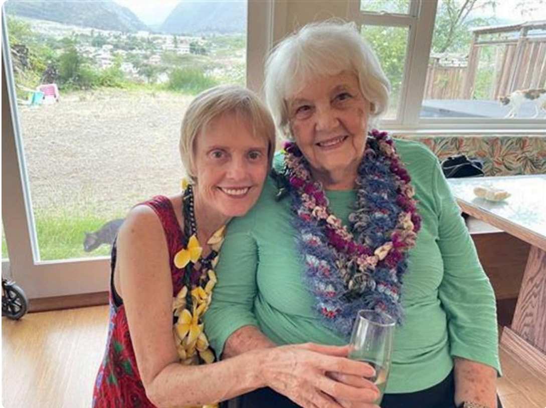
My loving Mother and me May, 2022